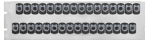
DD 32 V2